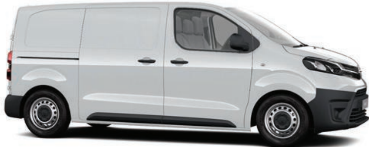
Icy White (EPR)