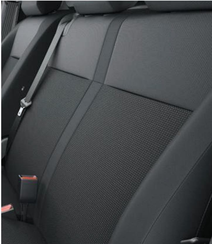
Dark grey fabric (43FT)

Available in dark grey fabric with a unified black instrument panel that delivers a fresh image.