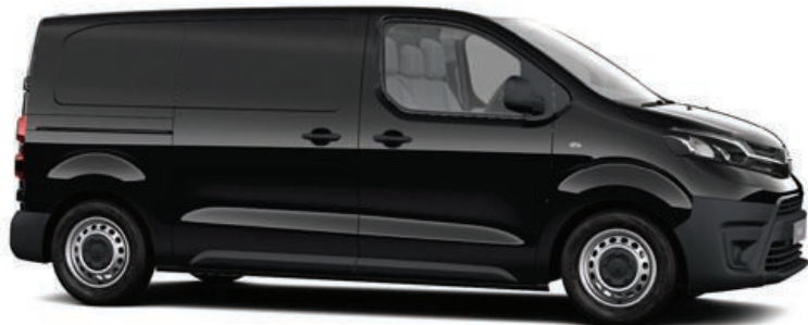
Absolute Black (KTV)