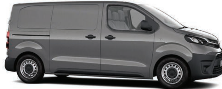
Dark Grey (EVL)