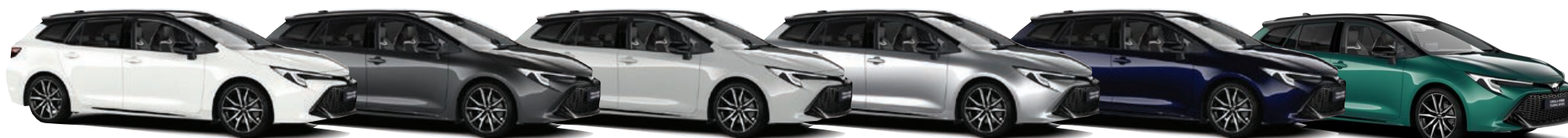
Pure White Bi-tone (2NR)