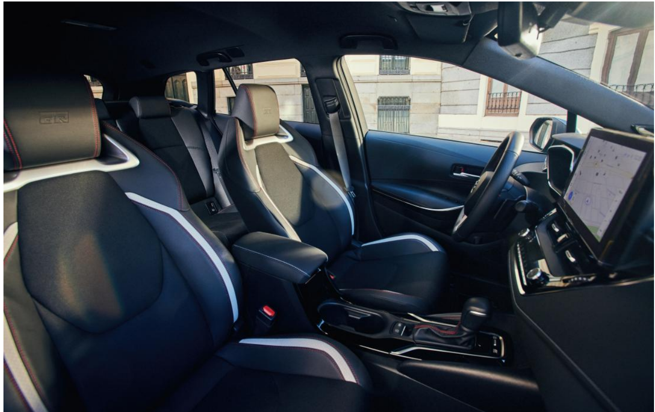
Black Fabric with Grey Stitching (Luna) Black Partial Synthetic Leather Upholstery (Sol & GR SPORT)